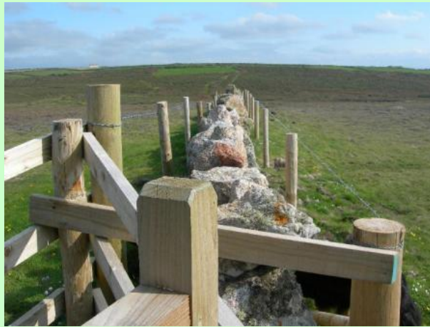
Fencing near Porthgwarra

“My family and I have spent much of our lives on the moors and cliffs of West Cornwall and still do, however the pleasures we have enjoyed for generations have now been largely ruined by the erection of miles of ugly barbed wire fencing, ridiculous "control" gates and the decimation of miles of footpaths. In areas where these cattle are already roaming I have seen in places erosion of the paths of up to and in some cases over 300mm. This includes potholes and large rocks that have been dislodged by their activities during wet periods and all within a matter of months. It would take decades to cause this much damage by walkers or riders. Large areas of these habitats are now impassable during much of the year. Other areas have become no go zones for many, particularly dog owners or those with small children, who fear passing too close to these formidable looking creatures. I think as so often the words of a child can sum up best; my young daughter recently on a walk from Porthgwarra to Nanjizal stood behind an enormous barbed wire fence that cut the landscape in half and clutching the wire said innocently, "Look dad, I'm in prison!" How sad.” [A. Fearn, Pendeen 3/4/2009]